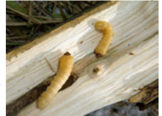
Larvae Longhorned Beetle

The United States Department of Agriculture, Animal and Plant Health Inspection Service (USDA APHIS) and the Ohio Department of Agriculture (ODA) announced that the first Ohio sighting of the Asian Longhorned Beetle ( Anoplophora glabripennis ) (ALB) infestation was found a few miles from the Village of Bethel in Tate Township, Clermont County, Ohio. The ALB has already caused tens of thousands of hardwood trees to be destroyed in Illinois, Massachusetts, New Jersey and New York. Consequently, the governor of Ohio signed an Executive Order restricting the movement of hardwood logs, firewood, stumps, roots and branches out of Tate Township. A map of the quarantine area can be viewed and/or downloaded at the following ODA website: http://www.agri.ohio.gov/TopNews/asianbeetle/docs/ALB_quarantine_map.pdf Surveys are currently being conducted to determine the size and scope of the ALB infestation in Southwest Ohio. As of Tuesday, June 28, 2011, 85 trees have been found to be infested.