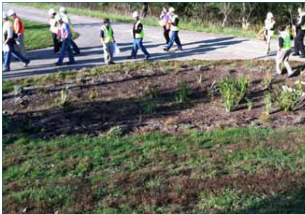
Rain Garden at the Green Township Bicentennial Park