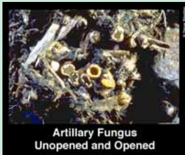
Artillery Fungus Unopened and Opened

This fungus develops in organic mulches and is typically a greater problem during spring and fall under cool, moist conditions. If organic mulches are used, old mulch should be stirred or loosened before distributing fresh mulch. There has long been speculation that mulches containing high carbon content (such as wood from ground tree limbs, wooden pallets, etc.) and a low pH are more likely to cause the problem. Cypress, cedar, redwood and pine bark mulch appear resistant to decomposition by the fungus and hence no problem occurs with the spores. Pennsylvania State University is currently conducting research on this problem. Trials involving mulch derived