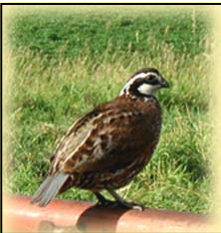
Bobwhite Quail

Time still remains to sign up for CP33 “ Habitat Buffers for Upland Birds ”, a conservation practice that allows you to maximize cropland production, control soil erosion, improve water quality and help bring back upland birds.