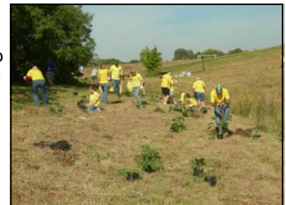
Miller Coors Tree and Fprb native grass Planting 2009

Native tree plantings with Friends of the Great Miami. Volunteers needed to revegetate the Great Miami River floodplain at Heritage Park in Colerain Township on 11/21 and at the Oxbow wetland in southwest Hamilton County on 12/19 (10:00 A.M. – 12:30 P.M. each day) - if interested in helping with restoration efforts, please contact Brian Bohl by phone at (513) 772-7645 ext. 15 or by e-mail at brian.bohl@hamilton-co.org .