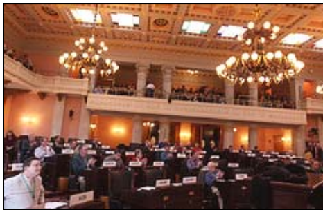
Delegate session in the Ohio House of Representatives Chamber.