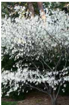
Robin Hill Serviceberry